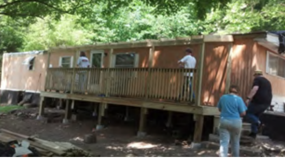
Continued on page 3